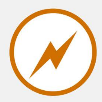
small organisation with a big impact