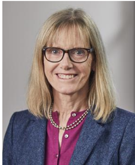
IASB Board member