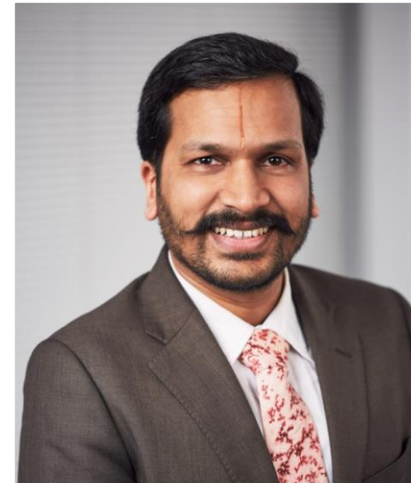
IASB technical staff