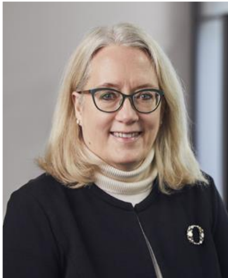
IASB Board member