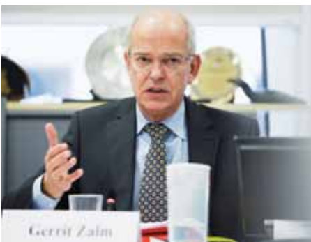
GERRIT ZALM CHAIRMAN OF THE IASC FOUNDATION TRUSTEES

A clear lesson of the financial crisis is that global financial markets demand a globally accepted and enforced financial reporting framework.