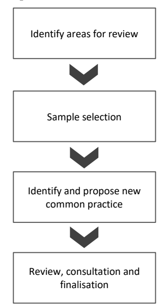
Figure 3 Process followed to identify common practice elements for inclusion in the IFRS Taxonomy